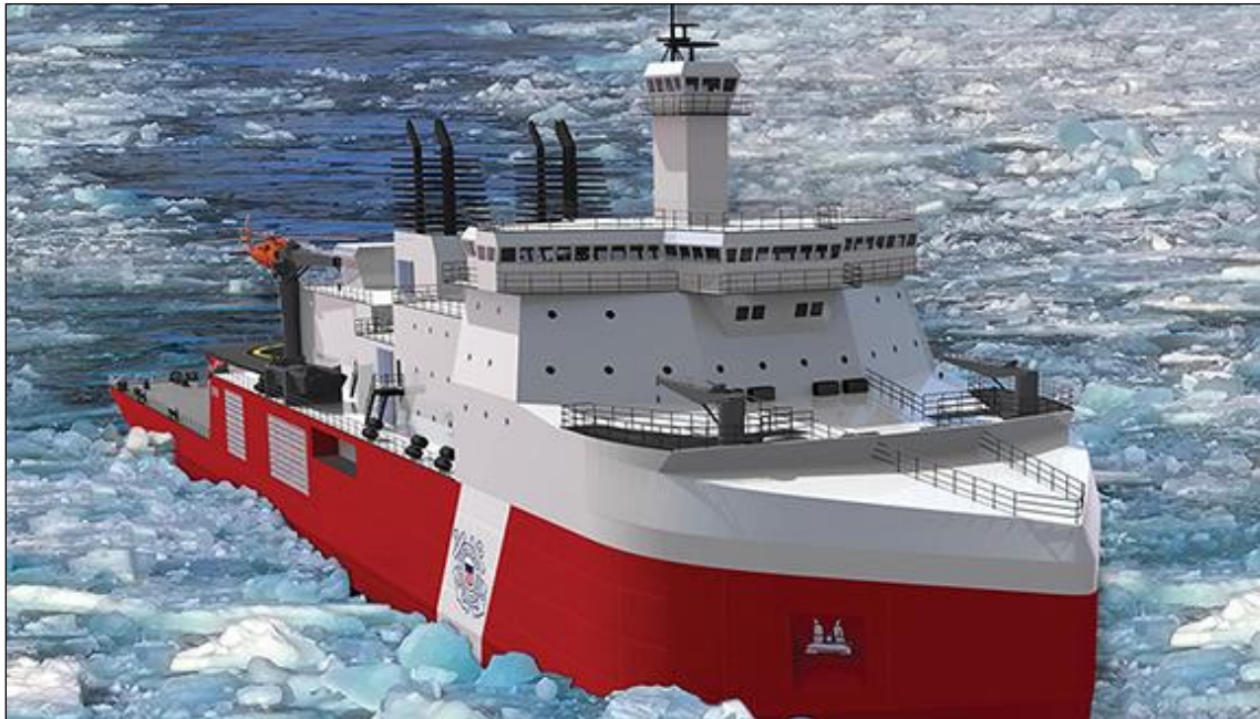
Figure 5. Rendering of Halter Marine Design for PSC