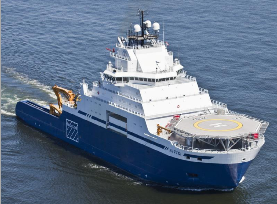
Figure A-7. Commercial Ship Aiviq