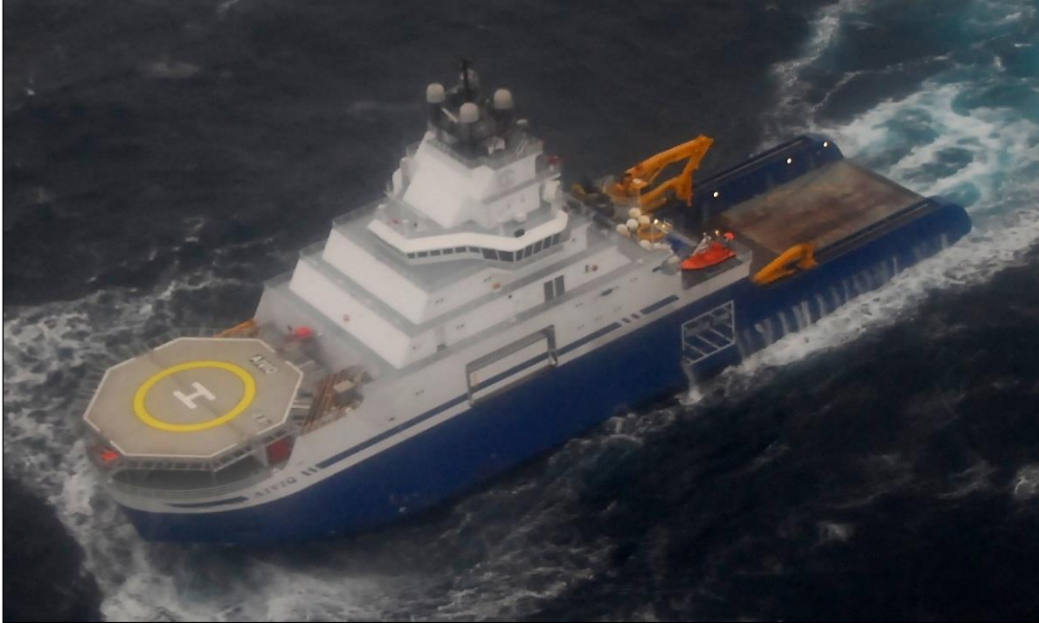
Figure A-8. Commercial Ship Aiviq