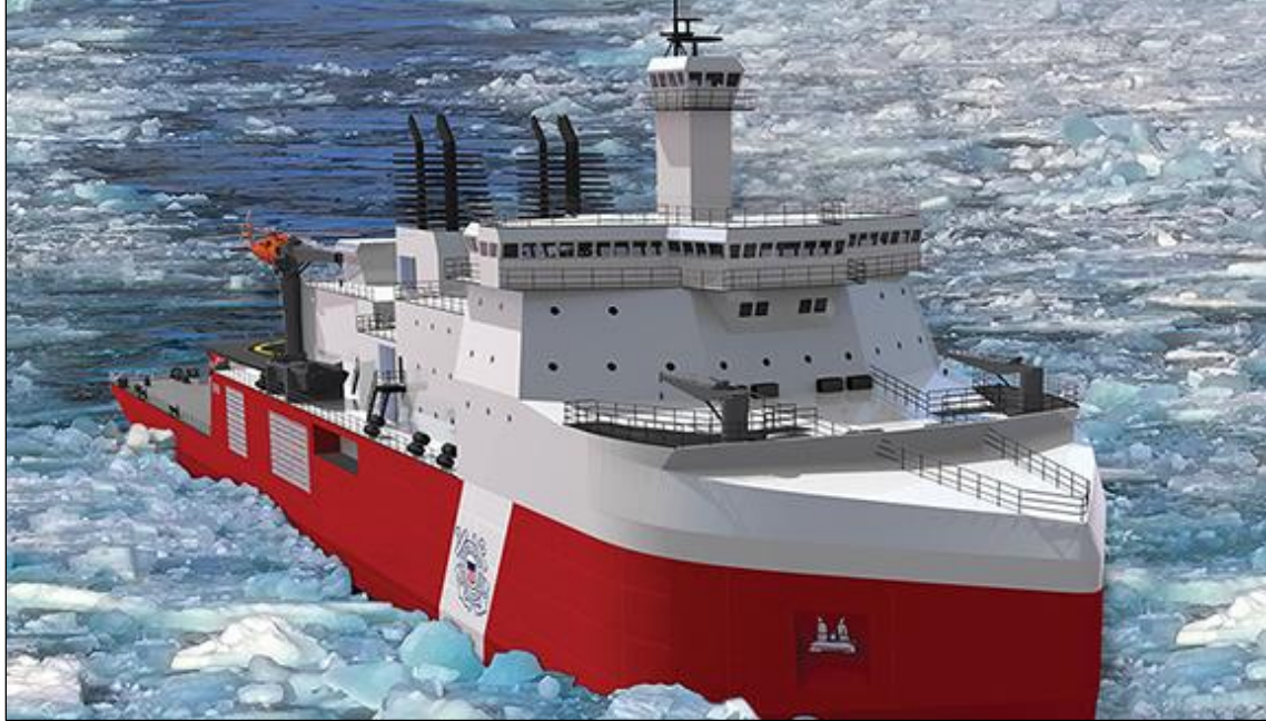
Figure 4. Rendering of Halter Marine Design for PSC