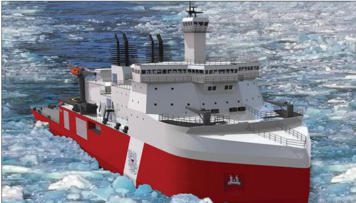
Figure 4. Rendering of Halter Marine Design for PSC