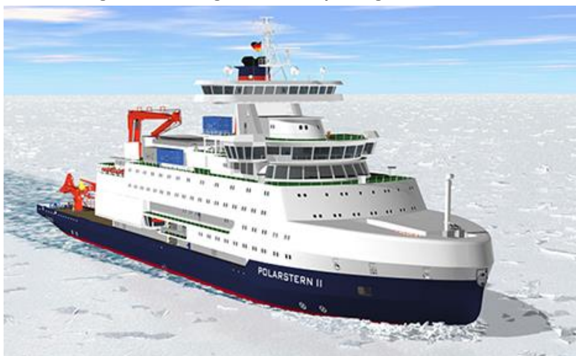
Figure 5. Rendering of SDC Concept Design for Polarstern II

Source: Cropped version of SDC Ship Design & Consult GmbH, design SDC2187, 133m Research Vessel, accessed May 9, 2019, at http://www.shipdesign.de/html/index.php?navi=3&navi2=80&navi3=115 . The image is enlarged at http://www.shipdesign.de/html/detail.php?id=396 .