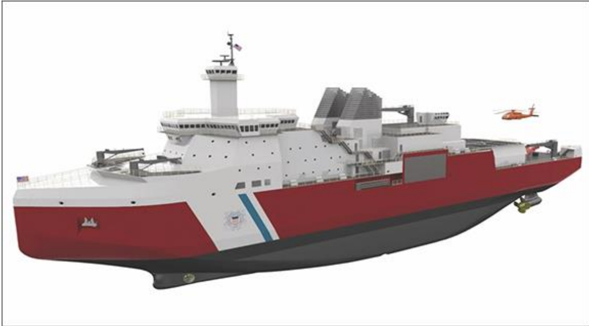
Figure 1. Rendering of VT Halter Design for PSC