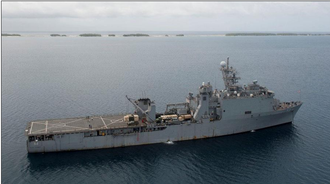
Figure 4. LSD-41/49 Class Ship

The Navy's caption for the photo states that the photo is dated July 13, 2013, and that it shows the Pearl Harbor (LSD-52) anchored off Majuro atoll in the Republic of the Marshall Islands during an exercise called Pacific Partnership 2013.