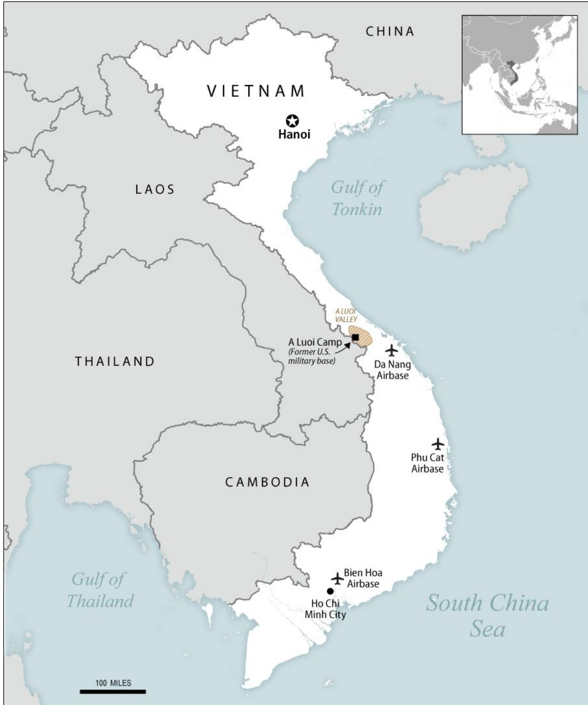
Figure I. Map of Vietnam Showing Agent Orange “Hot Spots”