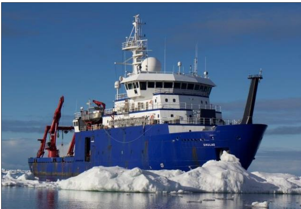
Figure A-6. Sikuliaq