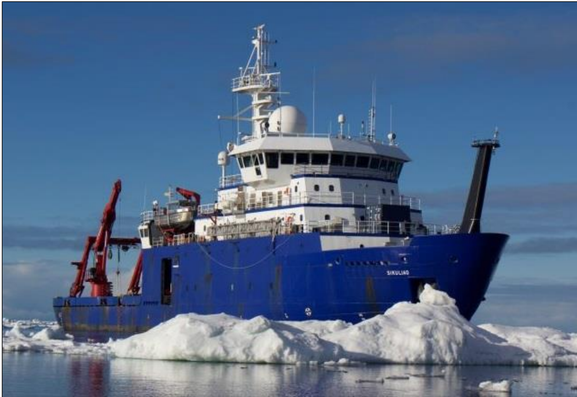
Figure A-6. Sikuliaq