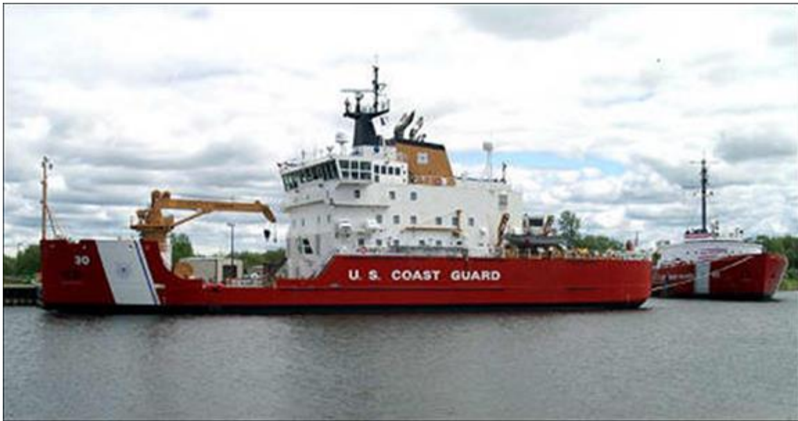
Figure E-1. Great Lakes Icebreaker Mackinaw