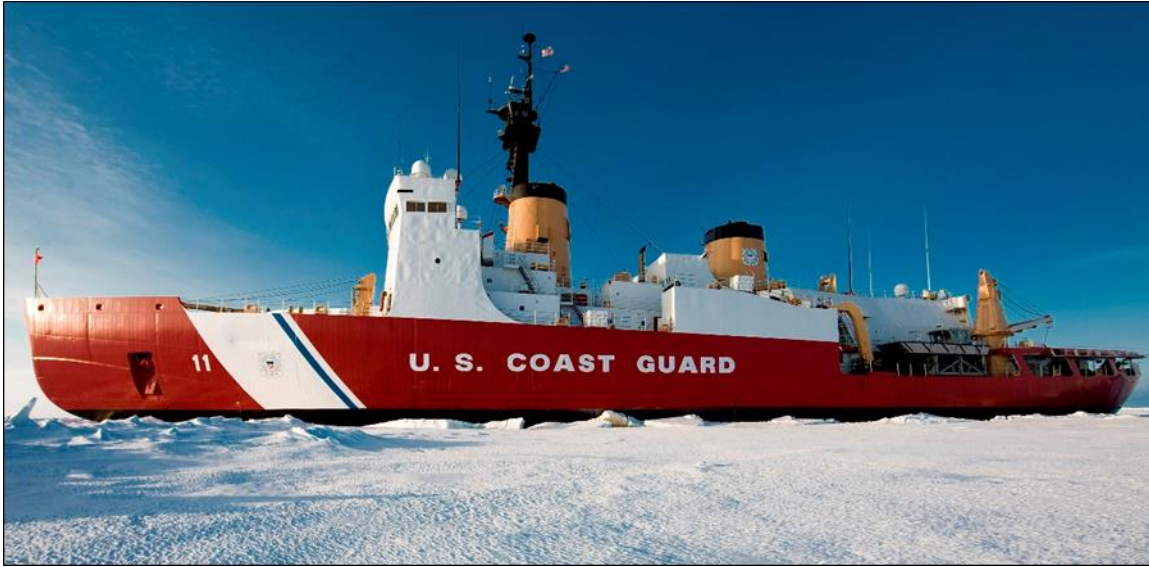
Figure A-2. Polar Sea

Source: Coast Guard photograph that was accessed April 21, 2011, at http://www.uscg.mil/pacarea/cgcpolarsea/img/PSEApics/FullShip2.jpg (link no longer active). The photograph accompanies Associated Press, “Reprieve for Seattle-Based Icebreaker Polar Sea,” KOMO News, June 15, 2012, posted at https://komonews.com/news/local/reprieve-for-seattle-based-icebreaker-polar-sea .