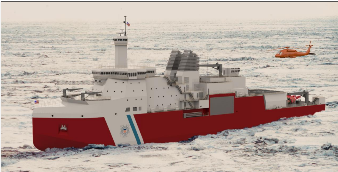
Figure 3. Rendering of VT Halter Design for PSC

A similar image was included in VT Halter press release, “VT Halter Marine Awarded the USCG Polar Security Cutter,” May 7, 2019, accessed May 8, 2019, at http://www.vthm.com/public/files/20190507.pdf .