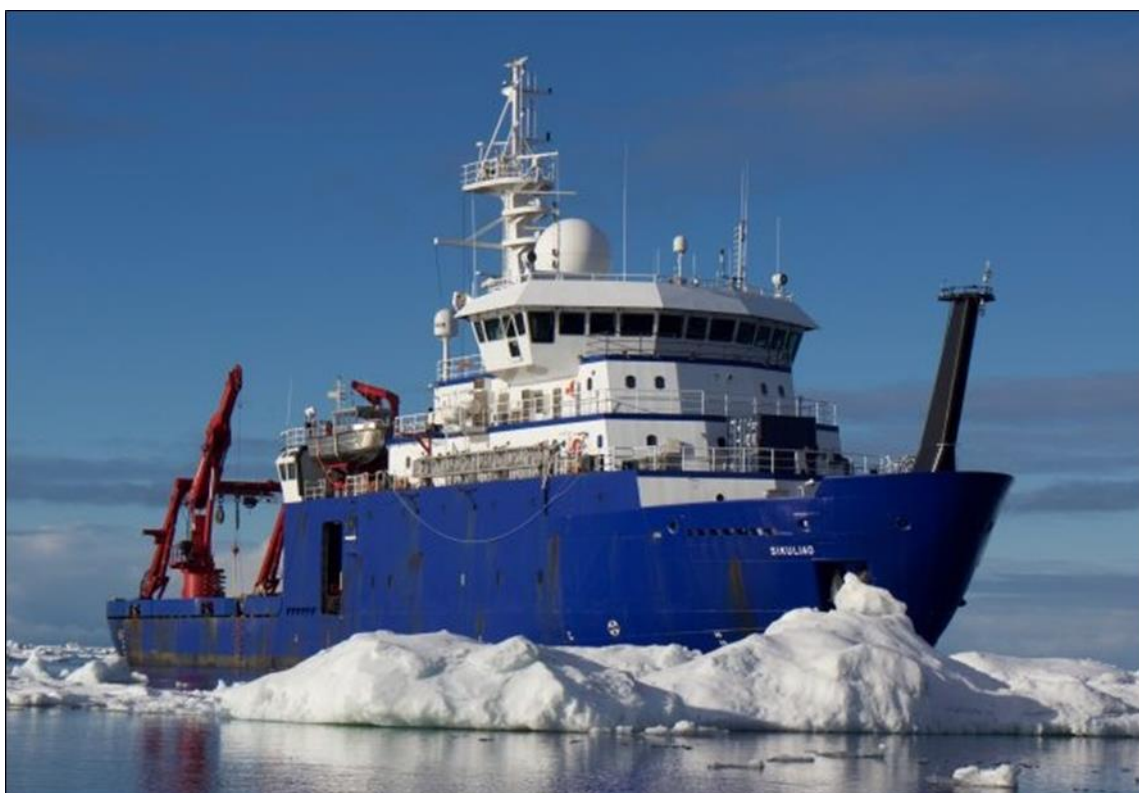
Figure A-6. Sikuliaq