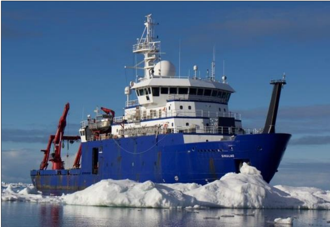
Figure A-6. Sikuliaq