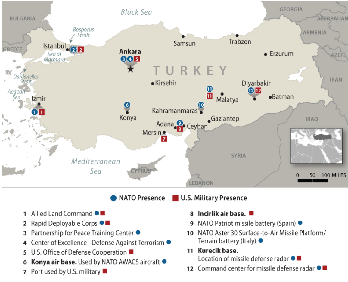
Figure A-2. Map of U.S. and NATO Military Presence in Turkey