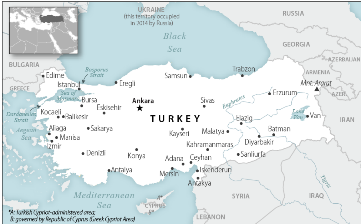
Figure A-I. Turkey at a Glance