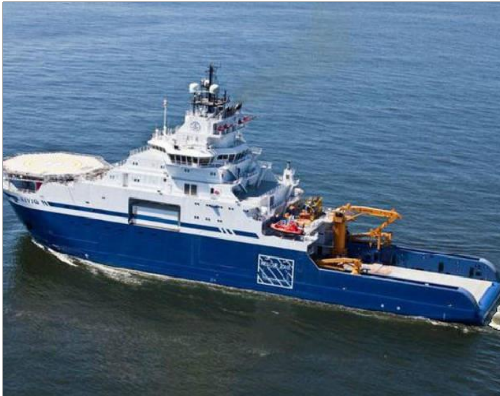
Figure 5. Aiviq