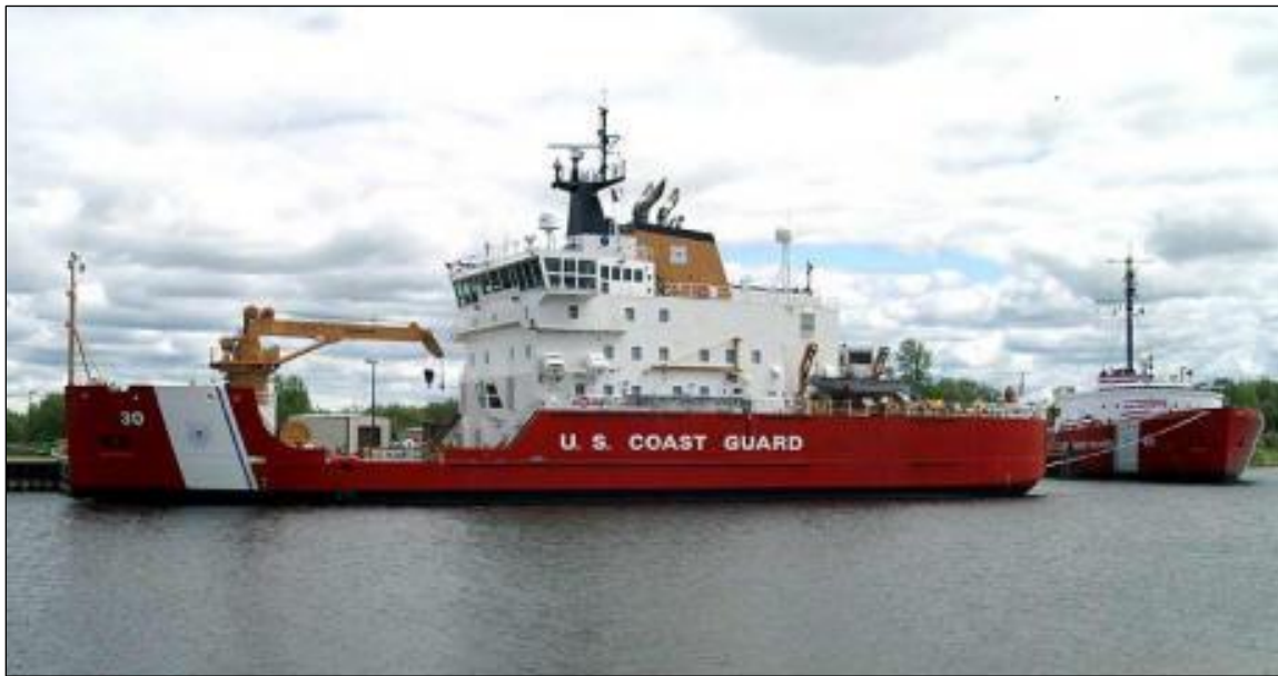
Figure E-1. Great Lakes Icebreaker Mackinaw