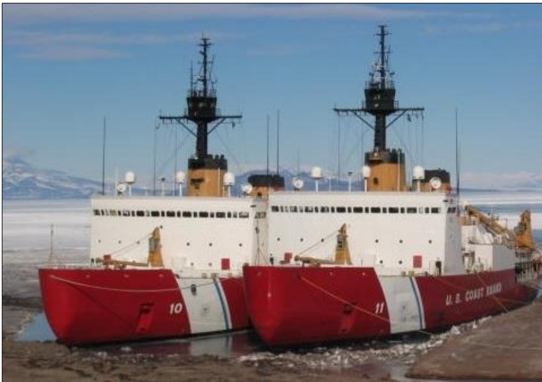
Figure A-1. Polar Star and Polar Sea (Side by side in McMurdo Sound, Antarctica)

Source: Coast Guard photograph that was accessed on April 21, 2011, at http://www.uscg.mil/pacarea/cgcpolarsea/history.asp (link no longer active). The photograph accompanies Kyung M. Song, “Senate Passes Cantwell Measure to Postpone Scrapping of Polar Sea Icebreaker,” Seattle Times , September 22, 2012, posted at http://blogs.seattletimes.com/politicsnorthwest/2012/09/22/senate-passes-cantwell-measure-to-postpone-scrapping-of-polar-sea-icebreaker/ .