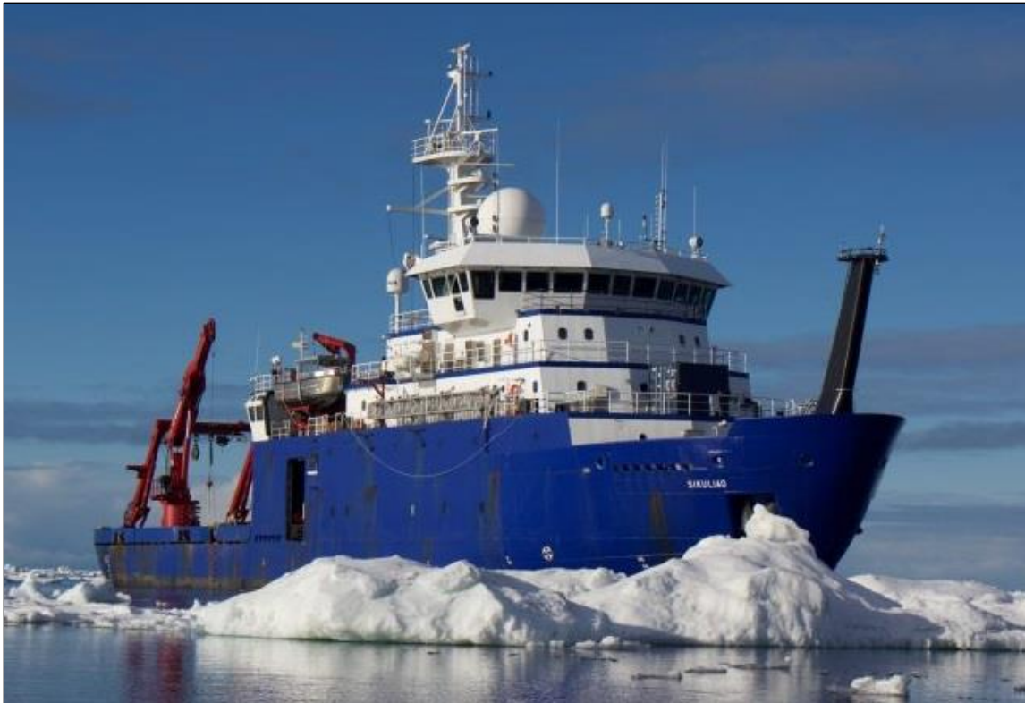
Figure A-6. Sikuliaq