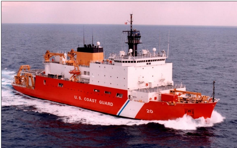
Figure A-3. Healy