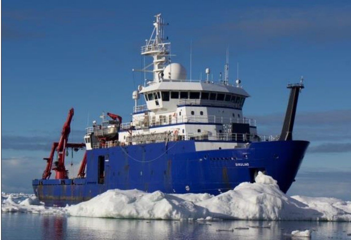
Figure A-6. Sikuliaq