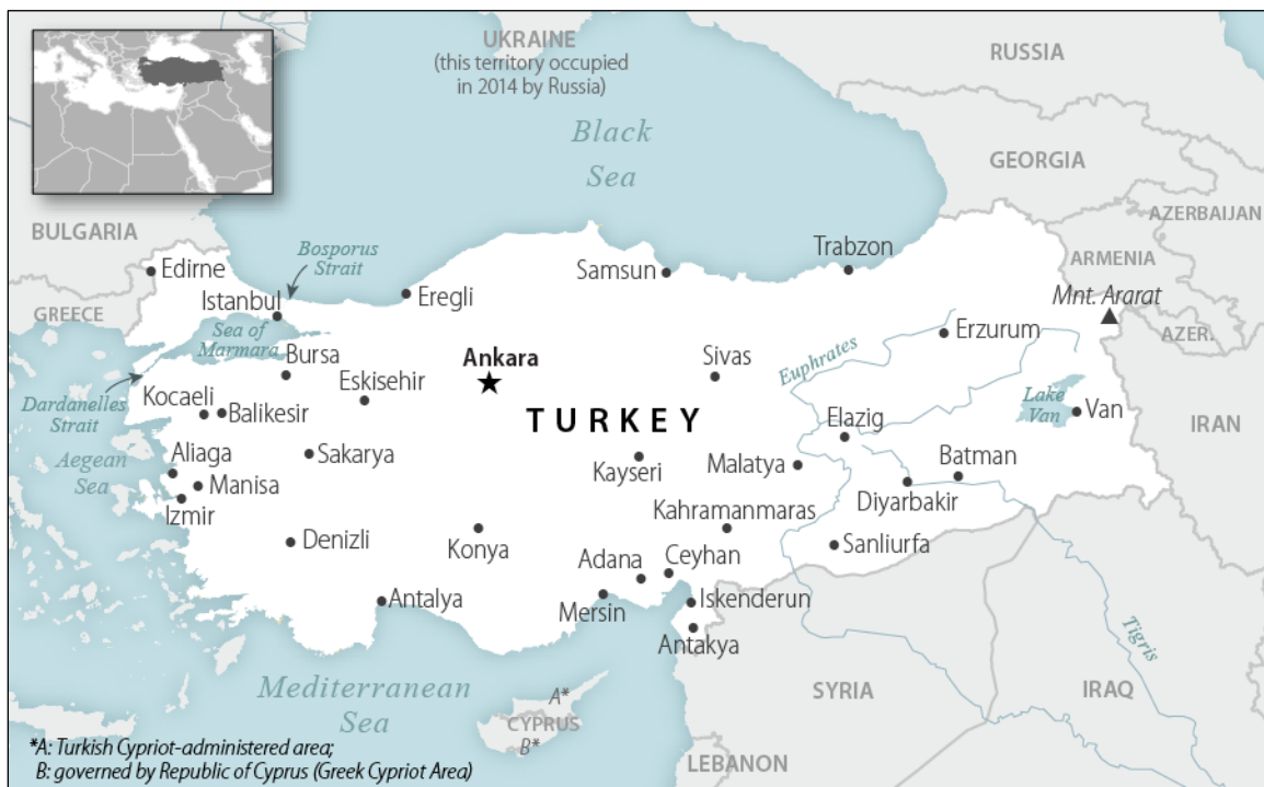
Figure I. Turkey at a Glance