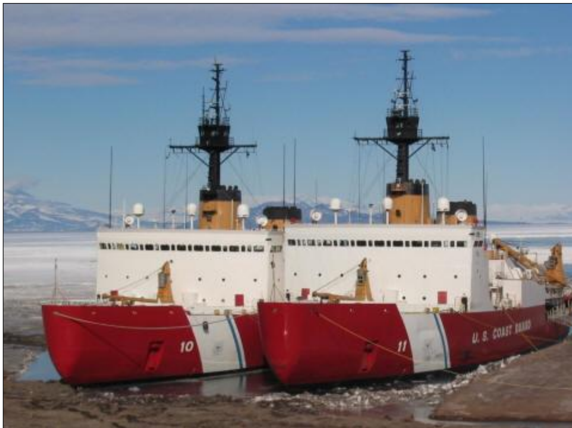
Figure A-1. Polar Star and Polar Sea (Side by side in McMurdo Sound, Antarctica)