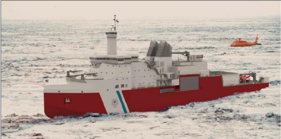
Figure 3. Rendering of VT Halter Design for PSC