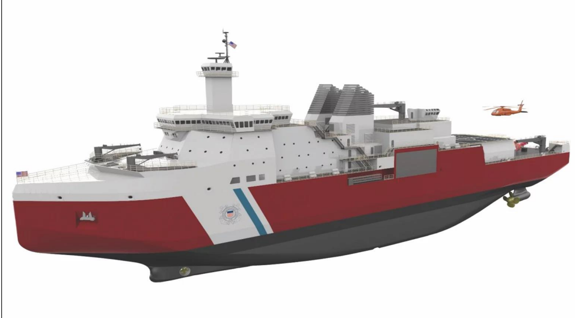
Figure 1. Rendering of VT Halter Design for PSC