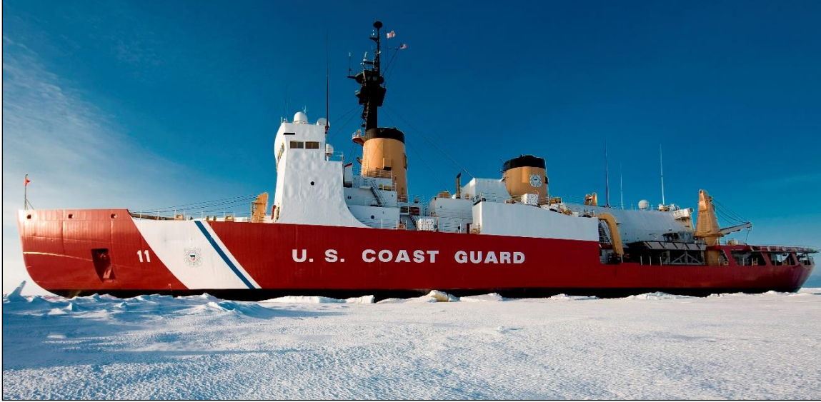
Figure A-2. Polar Sea