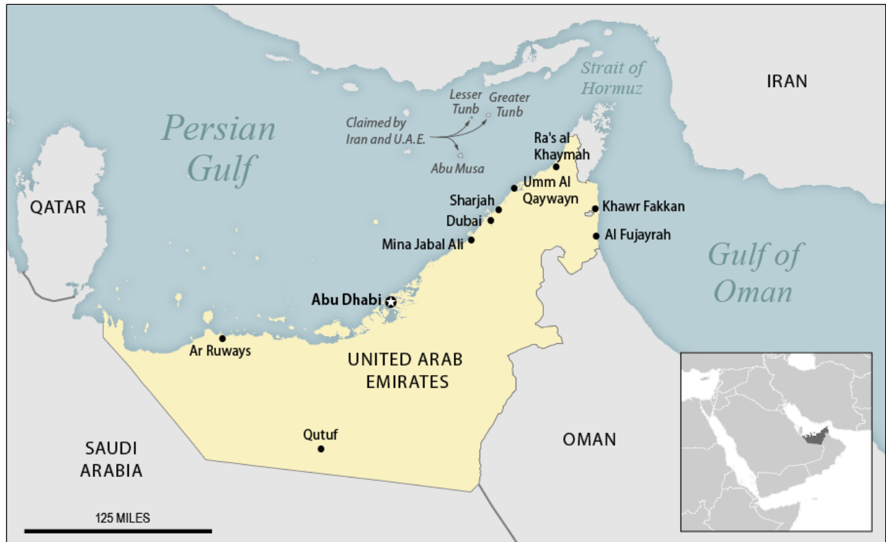
Figure I. UAE at a Glance