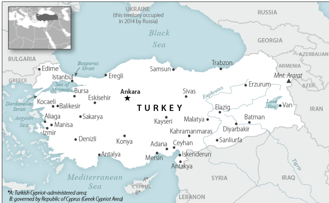
Figure 1. Turkey at a Glance