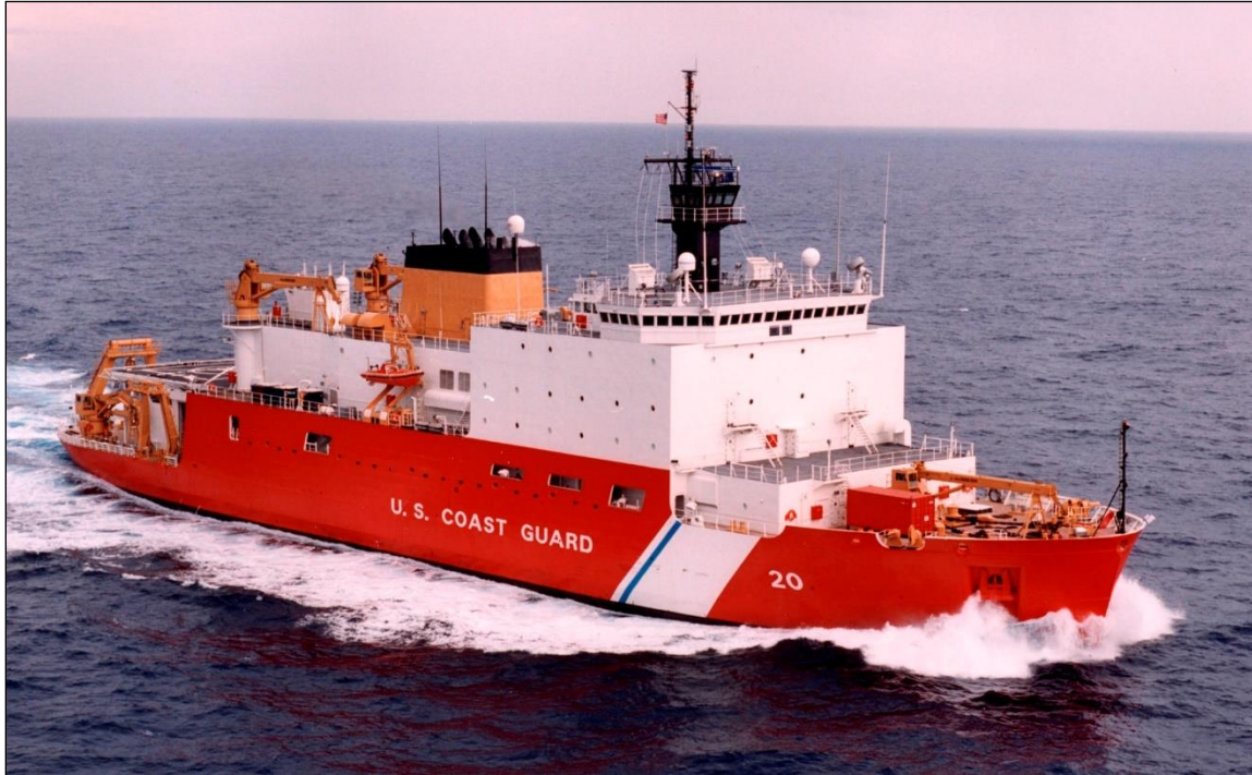
Figure A-3. Healy