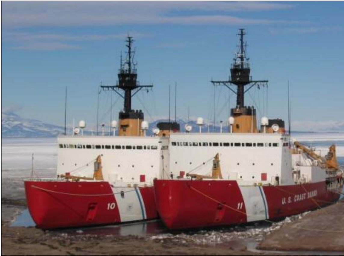
Figure A-1. Polar Star and Polar Sea (Side by side in McMurdo Sound, Antarctica)