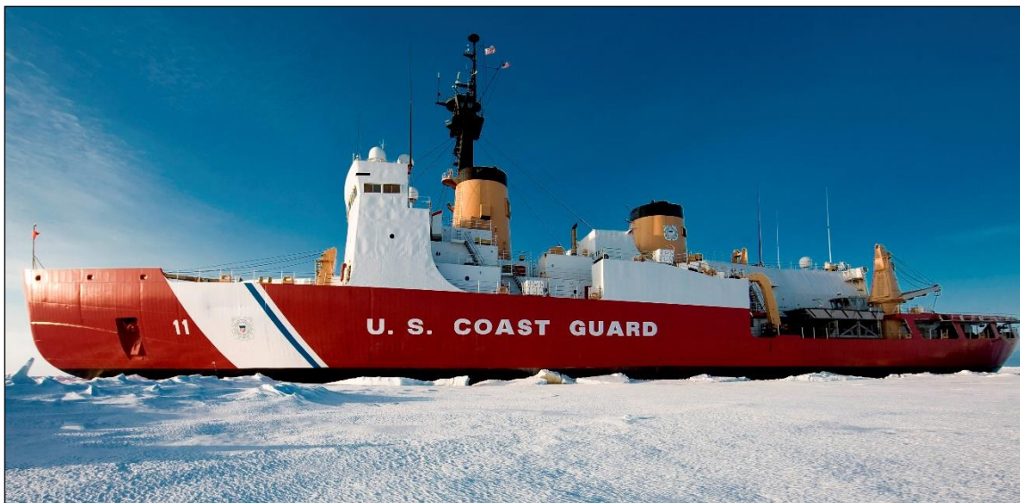
Figure A-2. Polar Sea