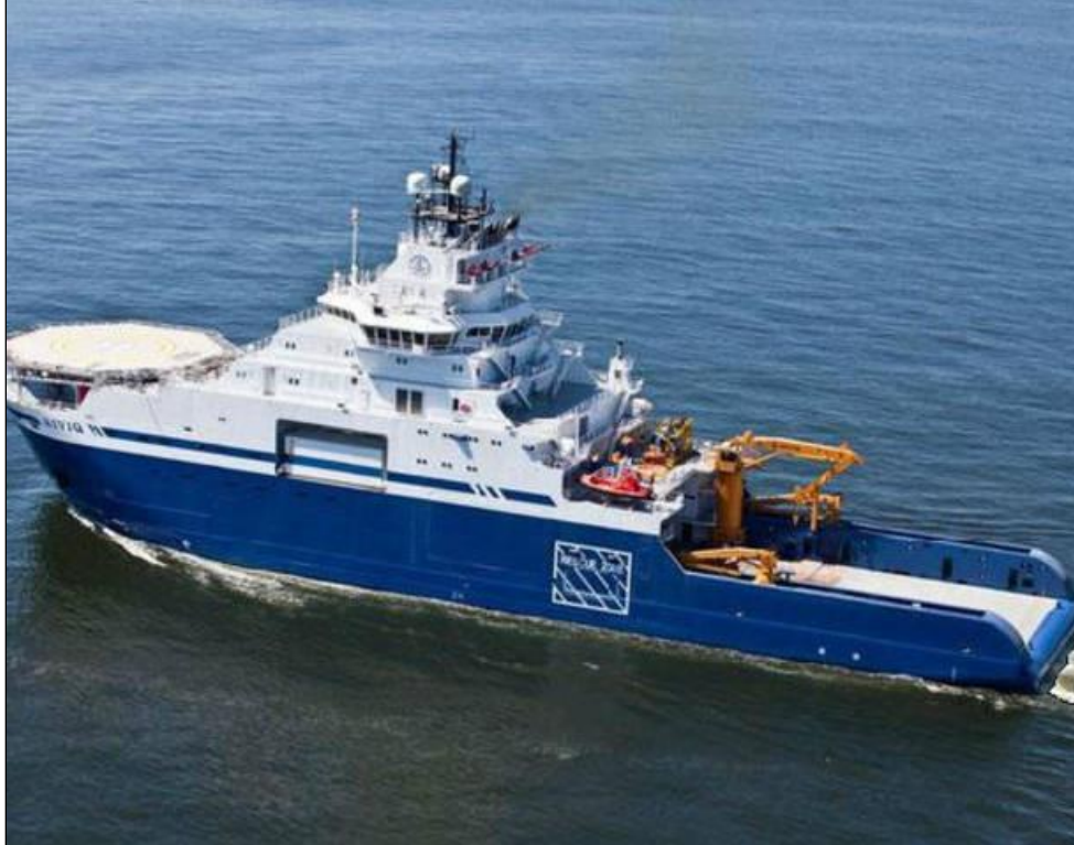
Figure 5. Aiviq