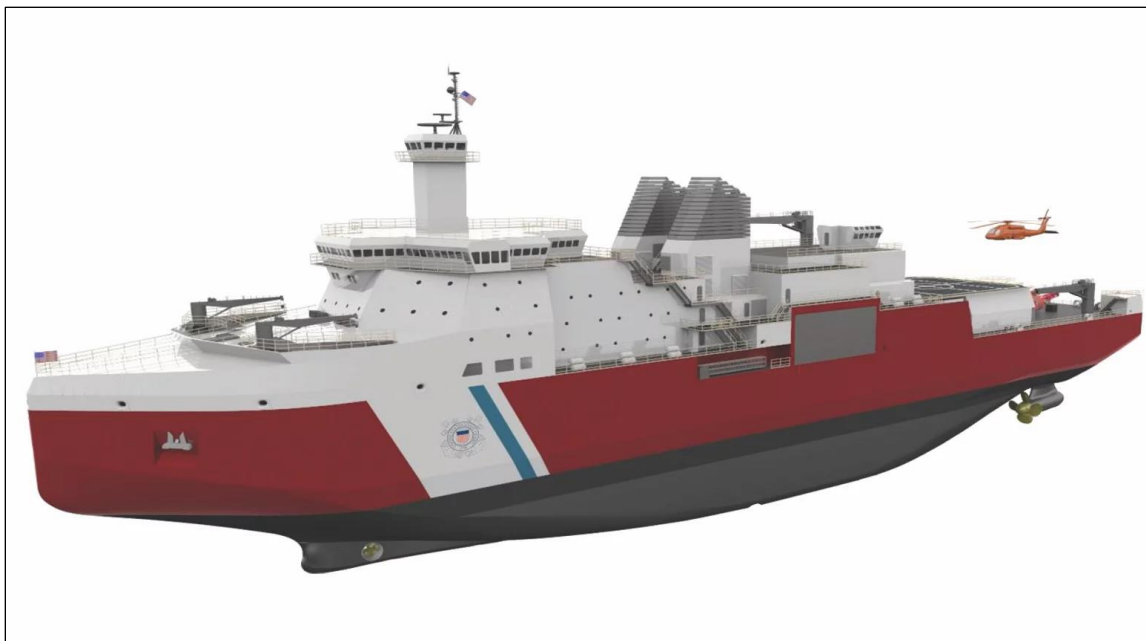
Figure 1. Rendering of VT Halter Design for PSC

Source: Illustration accompanying Sam LaGrone, “UPDATED: VT Halter Marine to Build New Coast Guard Icebreaker,” USNI News, April 23, 2019, updated April 24, 2019. The caption to the illustration states: “An artist’s rendering of VT Halter Marine’s winning bid for the U.S. Coast Guard Polar Security Cutter. VT Halter Marine image used with permission.”