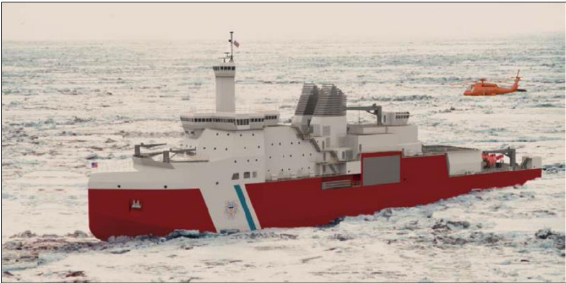
Figure 3. Rendering of VT Halter Design for PSC