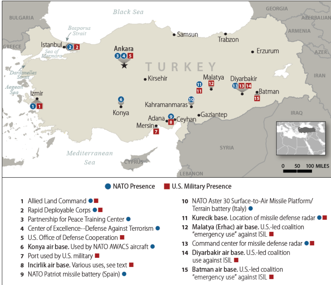
Figure 3. Map of U.S. and NATO Military Presence in Turkey