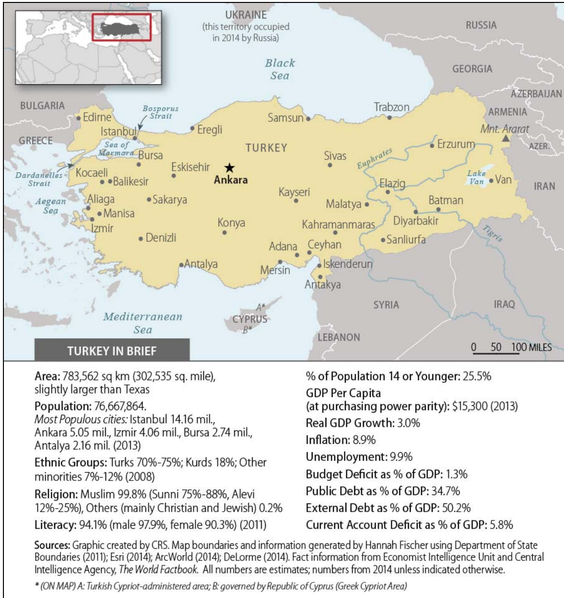
Figure I. Turkey: Map and Basic Facts

Domestic political changes from a military-guided leadership to a civilian one based largely on conservative Sunni Muslim majority sentiment may have heightened Turkish leaders' reluctance to support Western military action (such as ongoing action in Syria and Iraq), which many Turks describe as targeting Sunni Muslims. 5 According to one prominent U.S.-based commentator, "Sunni sectarianism and Islamic romanticism in pursuit of Muslim Brotherhood priorities" 6 have helped drive Turkish foreign policy in recent years. Such perceptions may have led to or reinforced differences between Turkey and the United States on issues such as these: